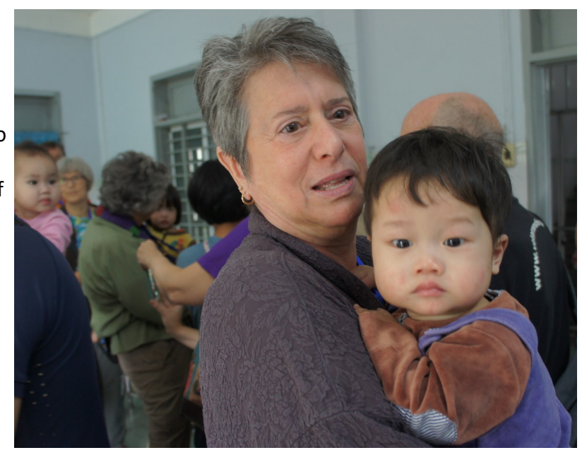
Chua Duc Son Pagoda Orphanage, Hue

One purpose of our annual tours is to make a tangible financial contribution to VFP 160's mission. Each tour member will donate at least $1,000 to a pool that we will collectively decide how to distribute at the end of the trip, such as — for bomb clearance, to help Agent Orange victims, to support hospitals, orphanages, schools, and other community needs.