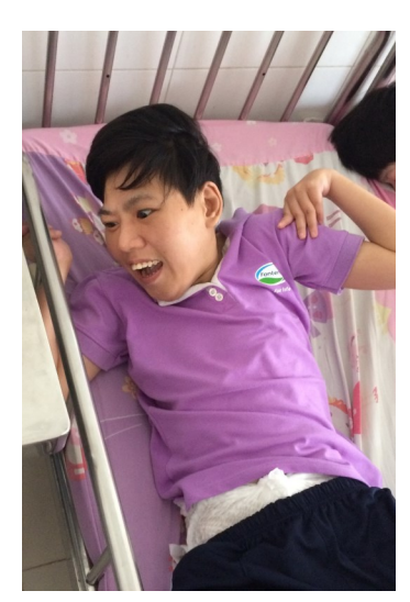
Agent Orange victim, Tu Do Hospital, HCMC