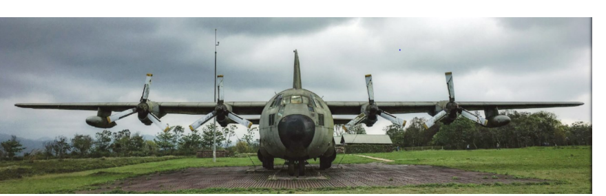
May 6: Khe Sanh