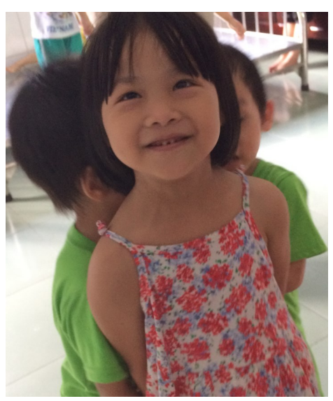
Chau Duc Son Orphanage, Hue.