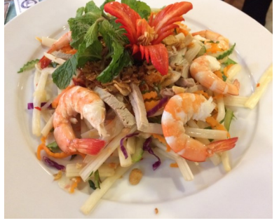
Did we mention the excellent food? Vegetarian/vegan? No problem.