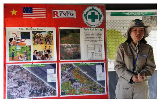
Explaining planned demining operation near Dong Ha