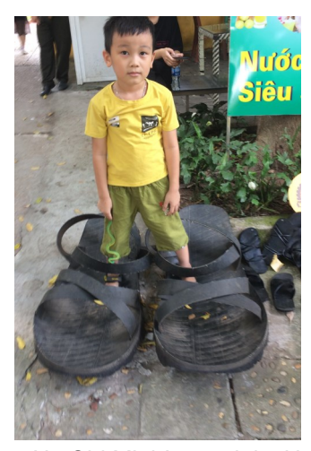
Filling Ho Chi Minh's sandals, Hanoi

Note: VFP organizers and in-country hosts receive no compensation. The Ha Noi travel company which handles in-country logistics, Viet Dreamland Travel Co., Ltd., has always given us generous discounts and sometimes separate donations to allow the maximum amount possible to go to VFP 160's beneficiaries.