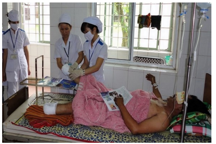
Too late for this farmer,