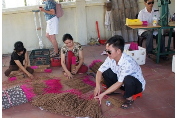
Project RENEW created this incense factory for blind persons in Quang Tri so that they can earn a living. At their request, VFP 160 built them an on-site kitchen.