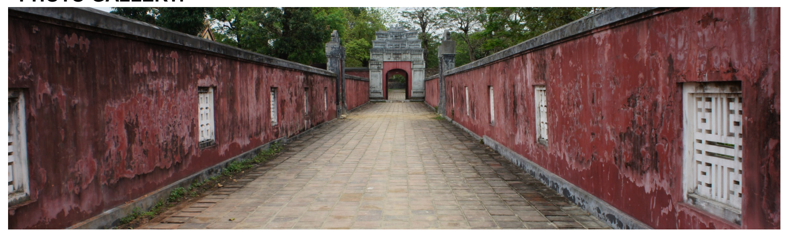
May 3:the Citadel, Hue