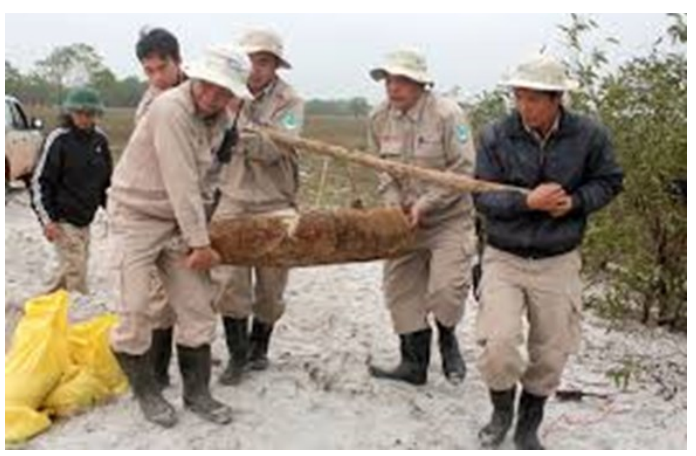
Project Renew demining teams haul away the American War, one bomb at a time.