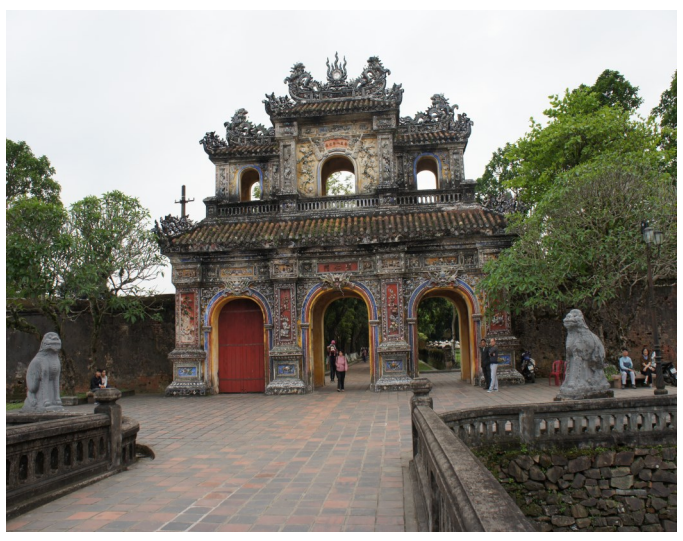
The Citadel, Hue, partially restored after the war