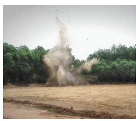
One less munition!