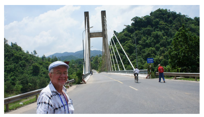
May 6: Da Krong Bridge, leading from Khe San to A Luoi, built for Viet Nam by the Cubans after the war, twice.