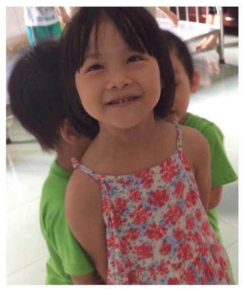
Chau Duc Son Orphanage, Hue.