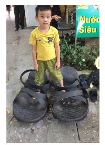
Filling Ho Chi Minh's Shoes, Hanoi

Note: VFP organizers and in-country hosts receive no compensation. The Hanoi travel company which handles in-country logistics, Viet Dreamland Travel Co., Ltd., has always given us generous discounts and sometimes separate donations to allow the maximum amount possible to go to VFP 160's beneficiaries.