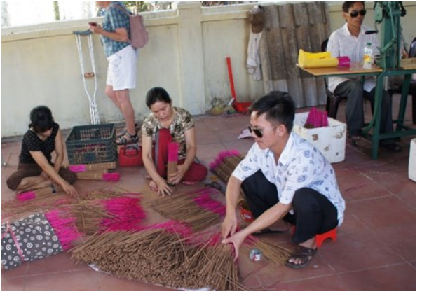
Project RENEW created this incense factory for blind persons in Quang Tri so that they can earn a living. At their request, VFP 160 built them an on-site kitchen.