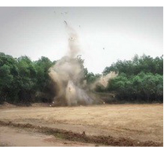
One less munition!