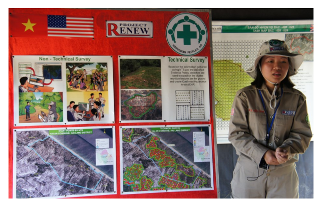
Explaining planned demining operation near Dong Ha