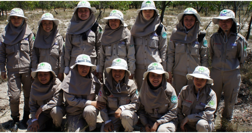
Project Renew demining teams haul away the American War, one bomb at a time.