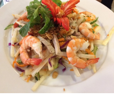
Did we mention the excellent food? Vegetarian/vegan? No problem.