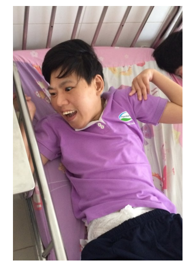
Agent Orange victim, Tu Do Hospital, HCMC