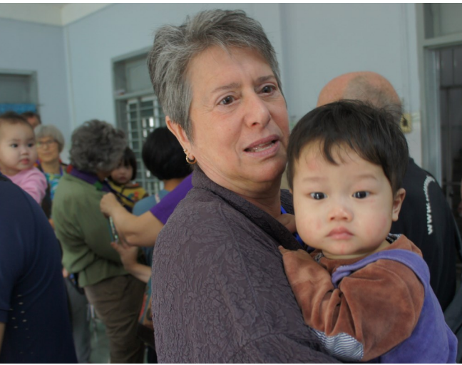
VFP Chapter 160 addresses the legacies of America's war. We help veterans and their families struggling to keep safe from unexploded ordnance (UXO), recovering from UXO injuries, and dealing with the tragedy of Agent Orange/Dioxin.