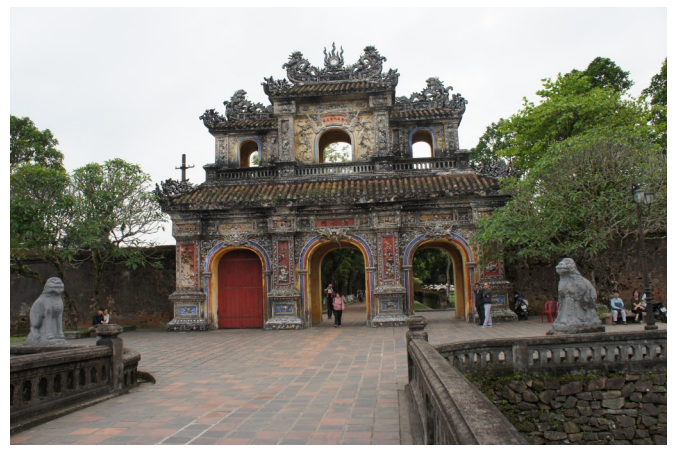
The Citadel, Hue, partially restored after the war