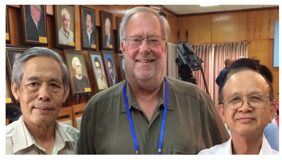
Meeting with friends—former enemy—Hanoi.

TOUR DATES: IMPORTANT! Most tour participants depart San Francisco (SFO) Thursday, Oct 10, just after midnight (i.e. very early in the morning of Oct 11). Folks from the east coast or other routes may choose other routes and flights—as long as everyone gets to Hanoi by midday October 12 (Vietnam time). At the end of the tour, you will leave Sunday Oct 27 from Ho Chi Minh City and arrive back in the US the same day, Sunday Oct 27.