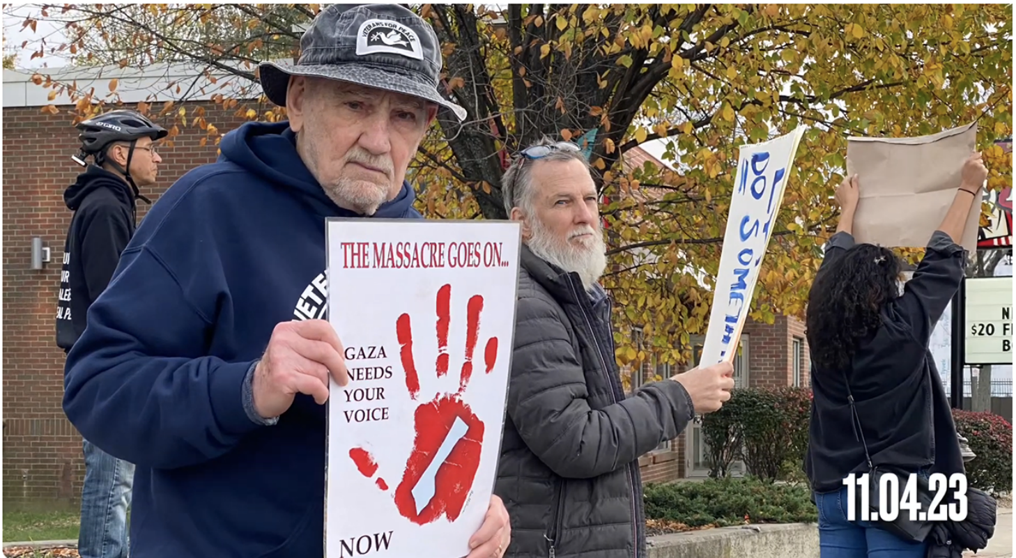
ABOVE: VFP members at the rally held in the Dorchester neighborhood of Boston.