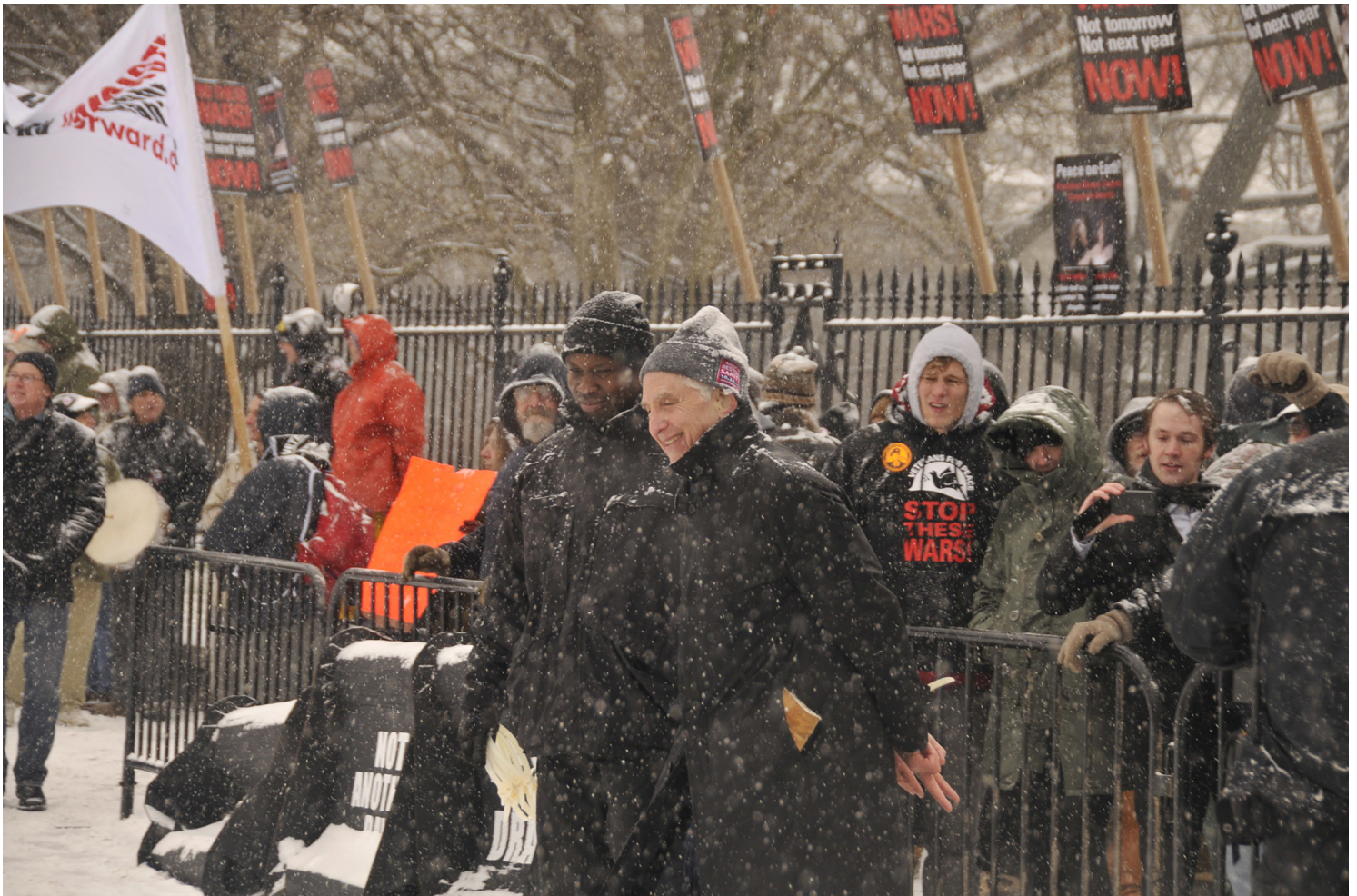
PHOTO: Daniel Ellsberg was one of 130 veterans and allies who were arrested at the White House protesting U.S. wars and occupation on December 16, 2010. Smiling as he is led away in handcuffs, he flashes a peace sign to the demonstrators behind his back.