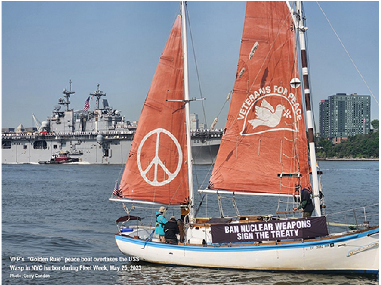
VFP's "Golden Rule" peace boat overtakes the USS Wasp in NYC harbor during Fleet Week, May 25, 2023