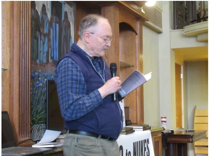
. . . and rings 11 bells at 11 Am on 11/11/2022