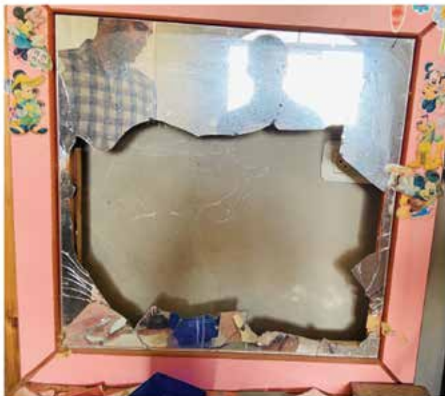
Where is the rest of me? Shattered in pieces.