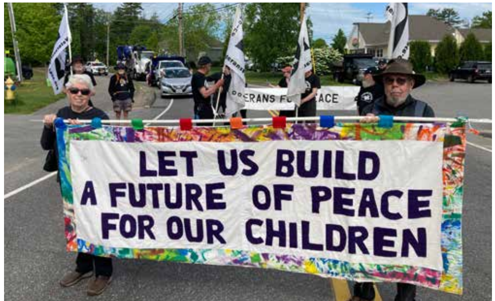
Members of Maine Veterans For Peace marched in their local Memorial Day parade.

Once Memorial Day was simple. Unofficially marking the first day of summer, I celebrated like most people having fun at BBQs and taking advantage of sales while also giving obligatory "Thank you for your service" to those in the nation's armed forces and veterans. I knew in theory that the purpose of the holiday was to honor service members who died in the nation's wars, but I did