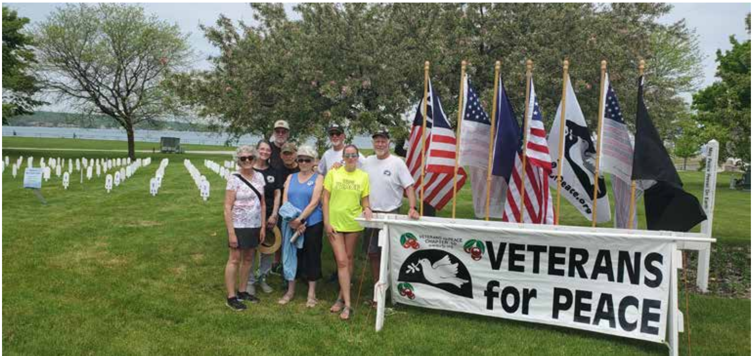
Veterans For Peace Chapter 50 members commemorate Memorial Day in Traverse City in Northern Michigan.

Rights, Demilitarize Okinawa, TPNW Support, Climate Change, War Tax Resistance, Ban Killer Drones, Black Lives Matter and Anti-Militarism.