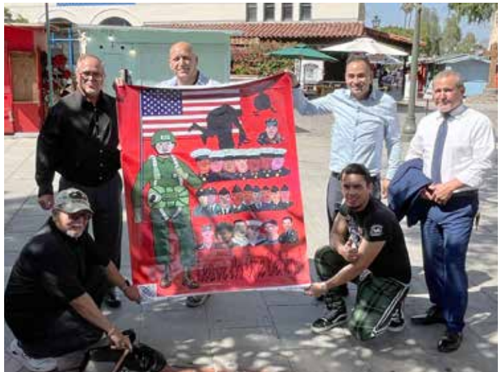
Repatriated veterans present the Leave No One Behind Mural to DHS Secretary Alejandro Mayorkas.

It is not only deported veterans who have benefited from our work. Migrants seeking protection from persecution at our border have also benefited. We are very active in the ImmVets program, working in conjunction with the ACLU. The Immigrant Defenders Law Center (ImmDef), public counsel nonprofit law organizations and advocates have created and are part of the ImmVets Deported Veterans Coalition. We also have a social media page, which I co-administer, on the migrant asylum-seeking project. We are also members of the Chaparral Humanitarian Alliance, a small group of nonprofit organizations