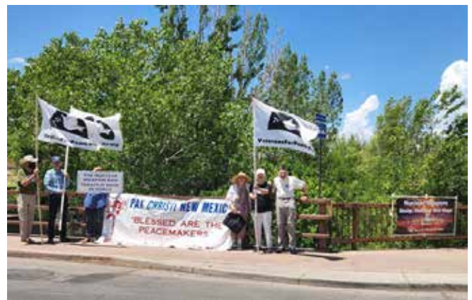
Santa Fe, New Mexico, June 3, 2022—VFP members join Nuclear Watch New Mexico and Concerned Citizens for Nuclear Safety in front of Los Alamos National Laboratories' new Santa Fe headquarters.