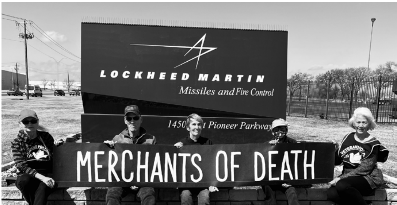
Members of Veterans For Peace joined a protest at the gates of Lockheed Martin in Grand Prairie, Texas, during the War Industry Resisters Network Week of Action!, April 17–24, 2022.