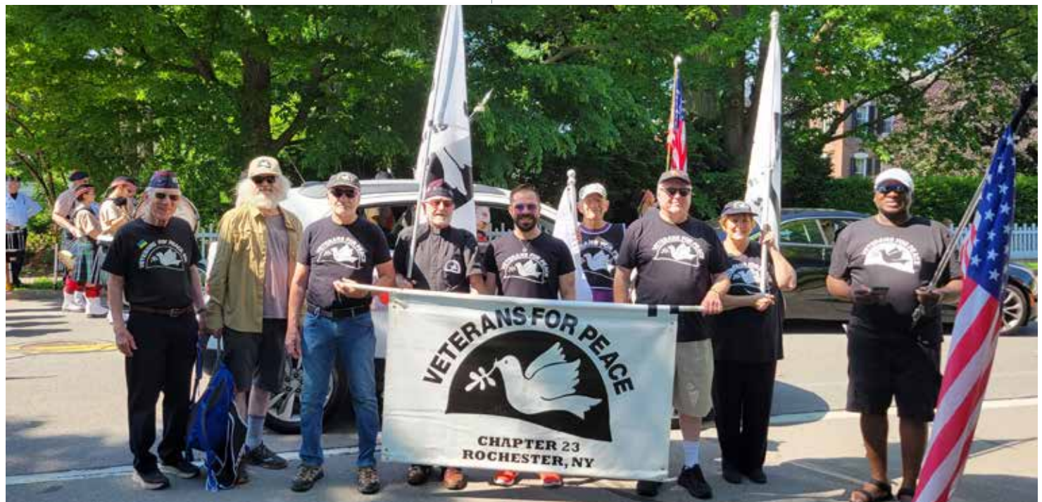
VFP Chapter 23, Rochester, New York, showed their colors in the Memorial Day parade in Rochester with ten members marching the full length of the parade accompanied by one SUV with large Veterans For Peace emblems as well as support for Black Lives Matter.

War is never the answer. In Ukraine there must be serious negotiations and an end to the war. Sanctions are another form of warfare. They almost never work for their intended purpose, and they harm many other people other than those they are directed towards. As we remember the victims of war, we must work to change the culture of militarism and war to one of nonviolence and peace.