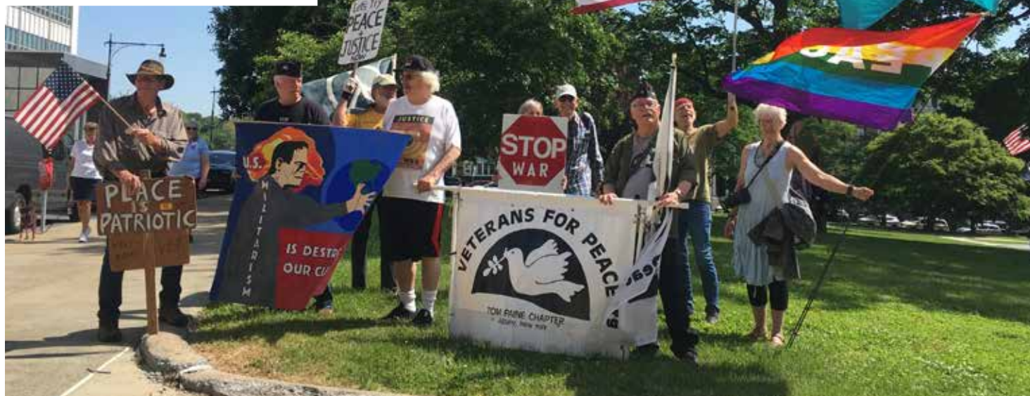
Upper left: VFP Chapter 99 placed this wreath at the Veteran's Memorial in Asheville, North Carolina, to remember all victims of war. Above: Tom Paine Chapter members and friends rest after walking in the Albany, New York, Memorial Day Parade.