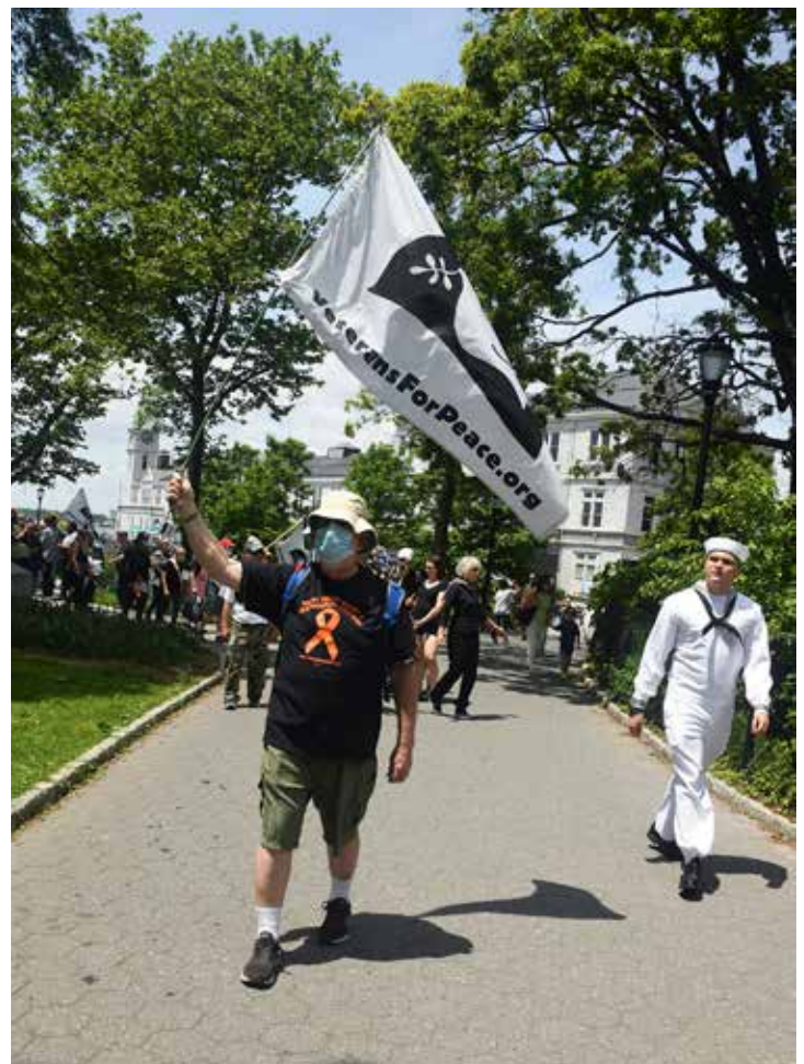
The New York City chapter's Memorial Day commemoration caught the attention of tourists in Battery Park including a few sailors from Fleet Week!

In-Person: Numerous events concerning Peace in Ukraine, Ending U.S. support for War in Yemen, Closing Guantánamo, Freeing Julian Assange, Korean Unification, Philippine Human