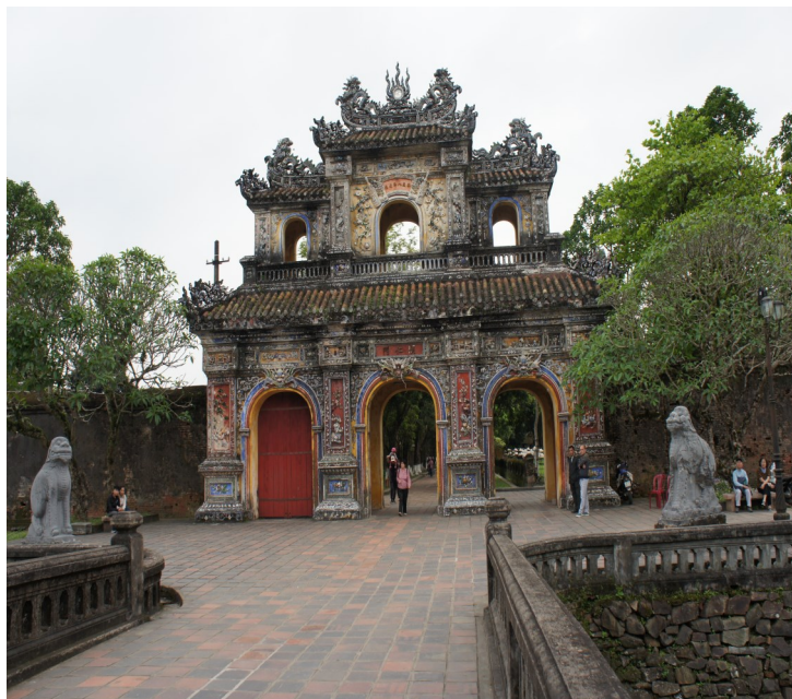
The Citadel, Hue, partially restored after the war