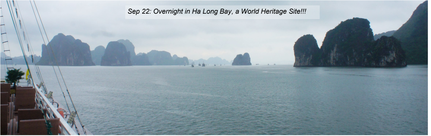
Sep 22: Overnight in Ha Long Bay, a World Heritage Site!!!