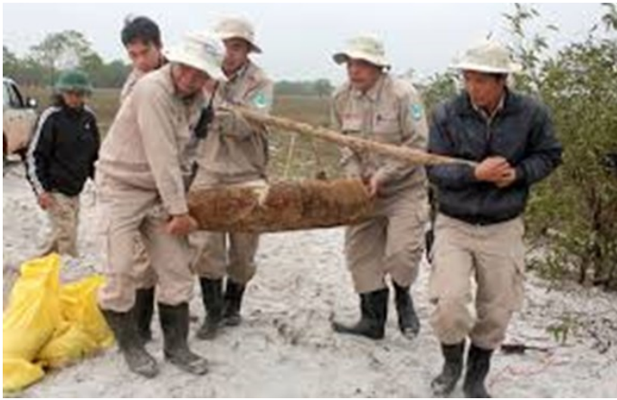
Project Renew demining teams haul away the American War, one bomb at a time.