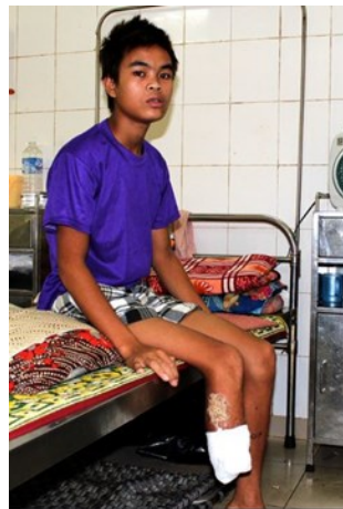
or this boy.