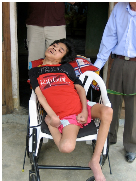
Agent Orange victim, Thua Thien