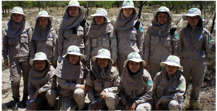
One of Project RENEW's all-woman demining teams.