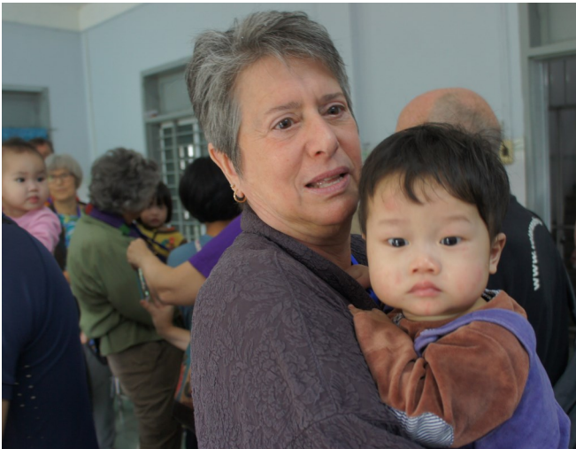
Chau Duc Son Orphanage, Hue

Viet Nam is a country now at peace, a place of natural beauty, a land of mountains as rugged and resilient as the people who inhabit them, of white sand beaches and inviting palm trees that sway in gentle sea breezes. The people, too, are gentle, and generous in spirit. They welcome Americans today – and especially veterans – with open arms, and forgiveness. A visit to Viet Nam can be heartening, even inspiring, for American veterans.