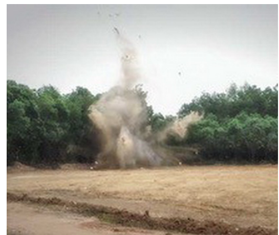
One less munition!