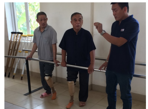
RENEW's prosthetics center, Dong Ha, Supported by VFP 160