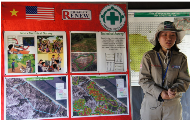
Explaining planned demining operation near Dong Ha