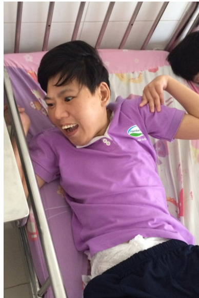
Agent Orange victim, Tu Do Hospital, HCMC