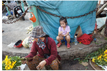
Local market, Dong Ha