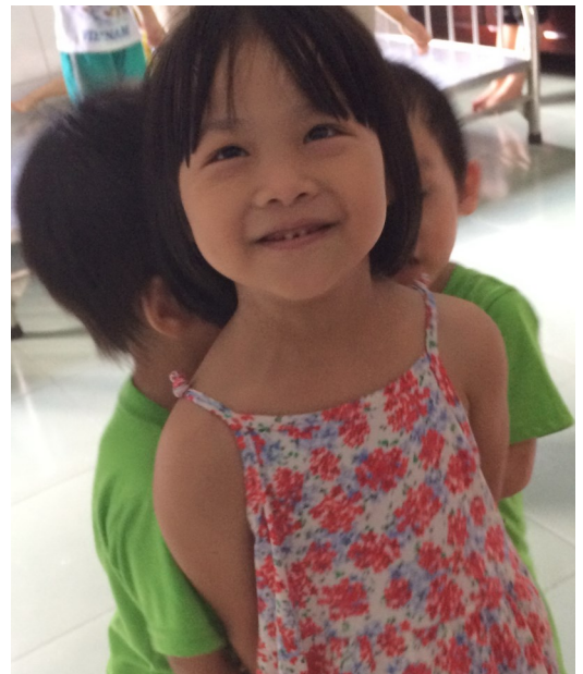
Chau Duc Son Orphanage, Hue.