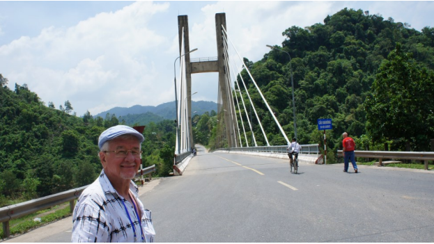
Da Krong Bridge, leading from Khe San to A Luoi, built for Viet Nam by the Cubans after the war, twice.