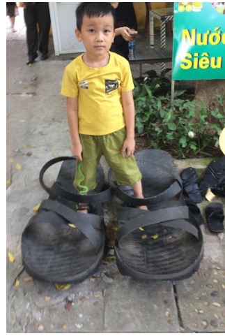
Filling Ho Chi Minh's Shoes, Hanoi

Note: VFP organizers and in-country hosts receive no compensation. The Hanoi travel company which handles in-country logistics, Viet Dreamland Travel Co. has always given us generous discounts and sometimes separate donations to allow the maximum amount possible to go to VFP 160's beneficiaries.