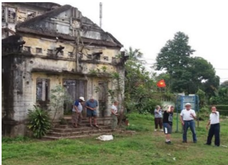
Long Hung Church, Dong Ha. One of only two structures in Quang Tri Province destroyed, but still standing, by the end of the war