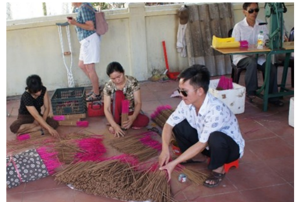
Project RENEW created this incense factory for blind persons in Quang Tri so that they can earn a living. At their request, VFP 160 built them an on-site kitchen.