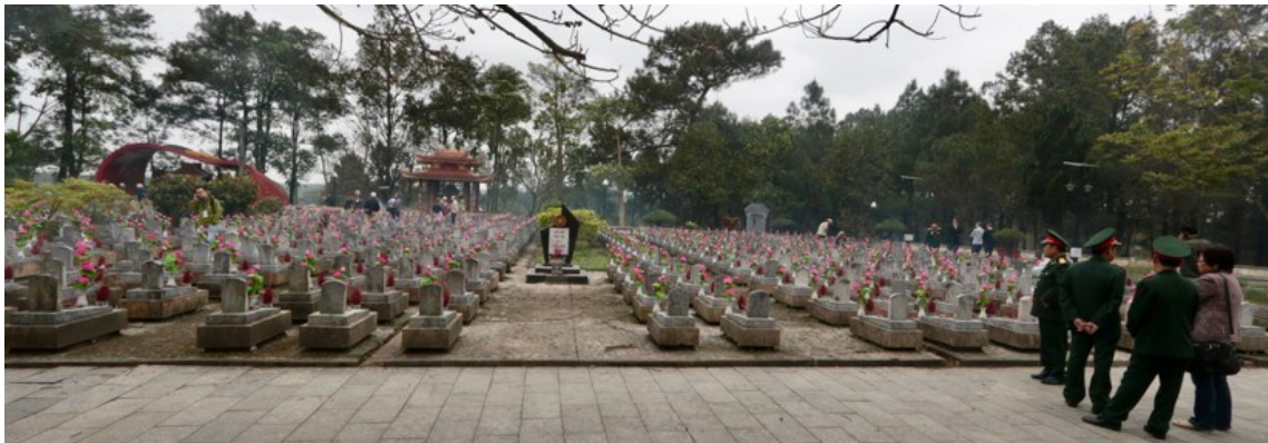
Trung Son National Cemetery, Quang Tri

Did we mention the excellent food? Vegetarian/vegan? No problem.