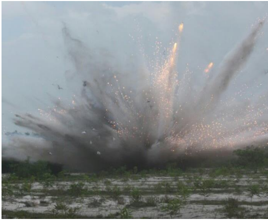
Controlled field demolition of ordnance destroyed by Project RENEW EOD team.

7:30 a.m. Breakfast at hotel, 8:30 a.m. visit Quang Tri Mine Action Visitor Center for briefing and video. See Project RENEW Explosive Ordnance Disposal (EOD) teams in the field and possible UXO detonation at the site. Lunch with officials in Cam Lo District. Visit Agent Orange / UXO victim families. Visit vocational workshop supported by Project RENEW for blind victims of UXO accidents. Dinner with Department of Foreign Affairs officials and Project RENEW staff at the hotel.