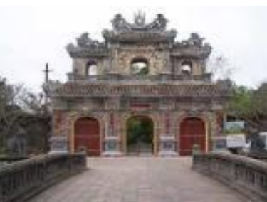
Hue is famous for its Citadel.

Two families in A Luoi who are receiving support from VFP for livelihoods and home improvements through the Hearts for Hue organization. Agent Orange is presumed to be a factor in the disabilities and poverty these families must live with.