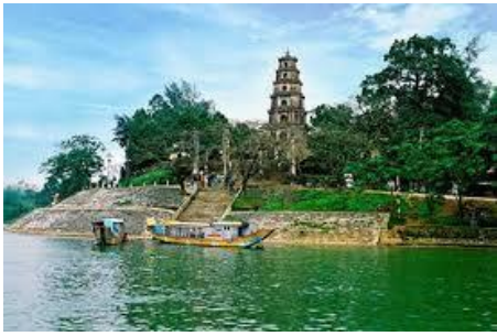
Thien Mu Pagoda was built in 1601. On display is the car driven by monk who burned himself to death in Saigon to protest Diem regime.

7:30 a.m. breakfast at hotel. Visit Chua Duc Son Pagoda and orphanage where Buddhist nuns care for abandoned babies and orphans, some thought to be suffering from Agent Orange. Then Thien Mu Pagoda, Emperor Tu Duc's Tomb, and lunch at Buddhist vegetarian restaurant, Lien Hoa. Optional guided tour of the Citadel, scene of fierce fighting during 1968 Tet Offensive. Much of the site has been rebuilt with support from UNESCO. Afternoon free. Dinner at Les Jardins De La Carambole in lovely villa inside the Citadel.