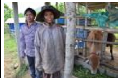
Young couple whose father is affected by Agent Orange were given a cow by VFP.