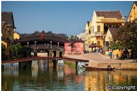
Hoi An: history, charm, and unique shopping with fine dining.