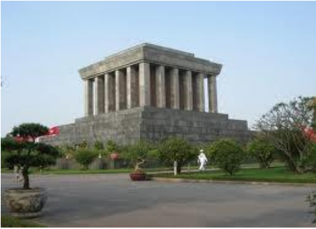
Ho Chi Minh's Mausoleum in Hanoi is on the site where President Ho read Viet Nam's Declaration of Independence in 1945. All Viet Nameese hope to visit here at least once in their lifetimes.

8:00 a.m. tour Ho Chi Minh Mausoleum, gardens, house on stilts. Welcome meeting with Vietnam Union of Friendship Organizations (VUFO), Veterans Association of Viet Nam (VAVN), VN Agent Orange Victims Association (VAVA). Topics may include US-VN relations, role of veterans in reconciliation, dealing with remaining war legacies such as UXO (Unexploded Ordinance), and AO (Agent Orange). Lunch at Koto Restaurant, visit to historic Temple of Literature. Afternoon tea with American Ambassador Ted Osius at U.S. Embassy residence.