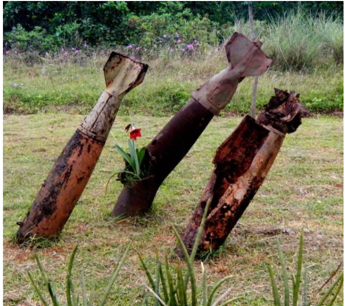
Now harmless weapons at Mine Action Visitor Center, where flowers grow peacefully.