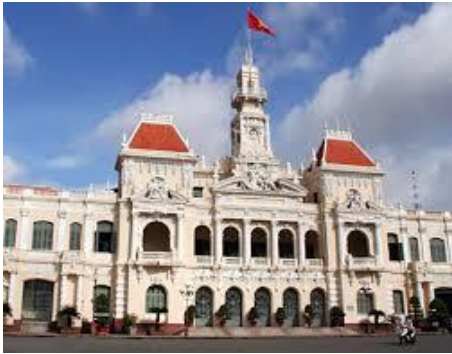
The Saigon City Hall is an ornate French colonial landmark in modern Ho Chi Minh City.

7:30 a.m. breakfast at Chu Hotel, check out at 8:30 a.m, airport coach to Da Nang International Airport for 10:00 a.m. flight to HCM City. Check in at Saigon Hotel, downtown, 41-47 Nguyen Du Street (848 3829 9734). Lunch on your own. Afternoon optional guided tour of War Remnants Museum, Reunification Palace, Catholic Church, Post Office, City Hall – or wander the streets of Saigon on your own. Dinner at 6:30 p.m. at a restaurant near the hotel.