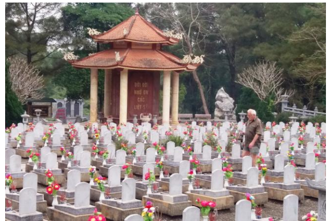
VFP member reflects while strolling through Truong Son National Cemetery, site of 10,000 graves of Vietnamese soldiers nestled among hills and pine trees near the Ben Hai River.