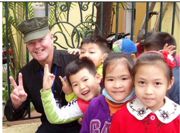
Viet Nam's kids are wonderful ambassadors.

8:00 a.m. breakfast at hotel, then visit Van Canh Friendship Village for Agent Orange treatment and rehabilitation, lunch with children and Viet Nameese veterans. Meet with Vietnam Association of Victims of Agent Orange (VAVA). Visit Army Museum, Hoa Lo Prison ("Hanoi Hilton"), Women's Museum. Traditional Vietnamese dinner in elegant French colonial villa at Wild Lotus Restaurant, 55A Nguyen Du.