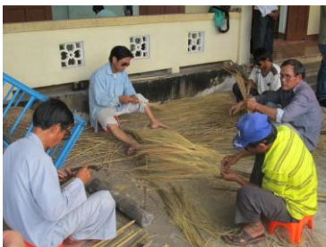
Workshop for blind UXO victims funded partly by VMF 160 tour donations.