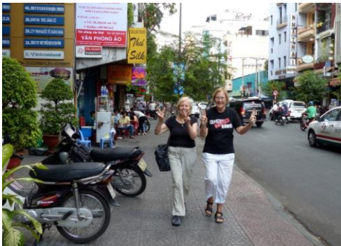
Final stroll through Saigon streets – then it's homeward bound!

Breakfast at hotel, free time on your own for last minute sight-seeing and shopping. Late morning checkout, leave luggage with hotel concierge, enjoy light lunch before flight departure. Delegation boards airport coach at 3:45 p.m. to Tan Son Nhat International for 5:45 p.m. flight back to the USofA.