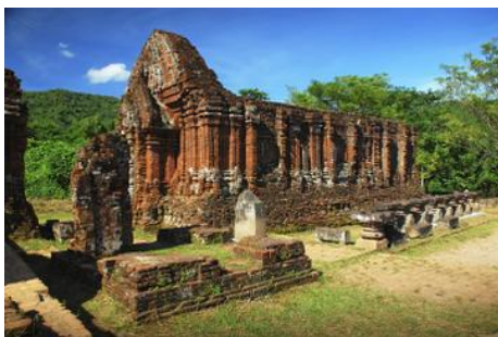
The My Son Cham ruins, about an hour's drive from Da Nang, are among several UNESCO World Heritage Sites in Viet Nam.

Breakfast at hotel until 9:00 a.m. followed by free time, beach time. Optional day trip to My Son Cham ruins, another UNESCO World Heritage site where baked brick towers bear mute testimony to a Hindu-based civilization and culture that still claims a few adherents, numbering only about 100,000 among Vietnam's 54 indigenous peoples. Also optional: another day in Hoi An, for tourism, shopping and a leisurely lunch by the river, or at the beach. Dinner on your own (with suggestions from tour guide).