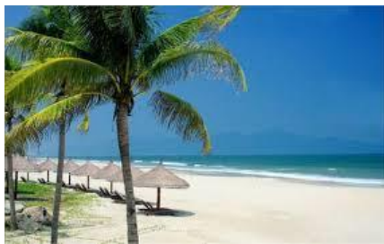
Balmy breezes and white beaches.