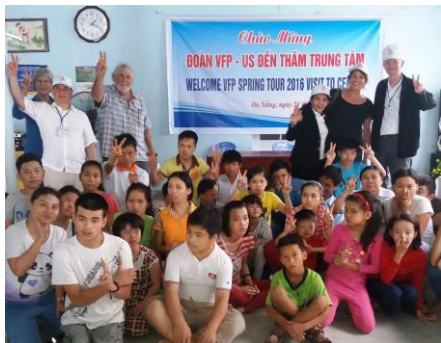
DAVA Center #3 in Da Nang.

8:00 a.m. breakfast at hotel, roundtable discussion with VUFO and VAVN in Da Nang. Open topics, US-VN relations, role of veterans. Lunch. Spend time at Da Nang VAVA Center 3, visit Agent Orange families who live nearby. Dinner at My Khe Beach (known to GIs during the war as China Beach, but the Vietnamese do not acknowledge that name).