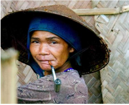
Woman of Pa Co indigenous tribe living in western areas of Hue and Quang Tri Province, near the Lao border.