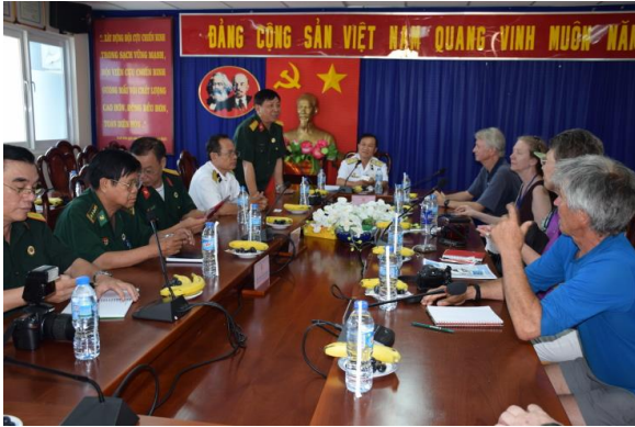
Final meetings in HCM City to recap trip experiences and share lessons learned with Vietnamese hosts such as national Veterans Association of Viet Nam.

7:00 a.m. breakfast at the hotel, followed by 9:00 a.m. meeting with VUFO. Visit Tu Du Hospital, center for disabled orphans, assumed to be Agent Orange victims. Meet Veterans Association of HCM City followed by lunch at Saigon Hotel. Group meeting after lunch to share observations, evaluate trip, and vote on funds distribution. Remainder of the day for sightseeing, shopping, relaxing. Final group dinner hosted by VFP 160 members at 6:30 p.m.