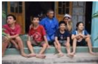
Family with four severely disabled children whose home has been repaired by VFP donation.