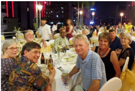
Tasty food and unique venues for VFP dining options in Saigon.

8:00 a.m. breakfast at the Saigon Hotel. Optional day trip to Cu Chi Tunnels, Cao Dai Temple, Tay Ninh Province near the Cambodian border. Travel by air conditioned coach. Lunch along the way. For those who stay in Saigon, enjoy sightseeing, shopping, relaxing on your own. Dinner at 6:30 p.m. at nearby riverside restaurant.