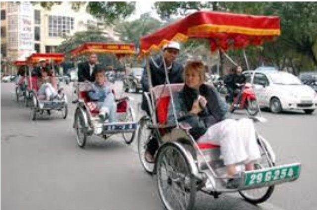
Cyclo ride in the Old Quarter, around St. Joseph's Church, Hoan Kiem Lake, and the Opera House.