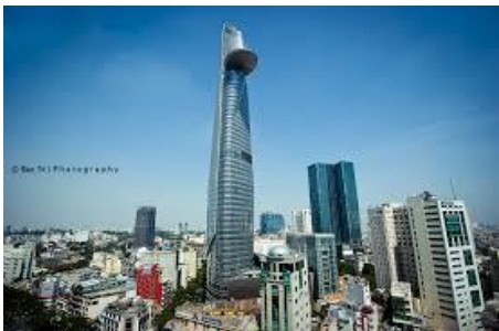
Tradition and culture play a role even as the city skyline changes.

Breakfast at the hotel until 9:00 a.m., followed by city tour, shopping, free time. Tour guide will be available for those with special requests. Optional river cruise available around the port of Saigon. Dinner at 6:30 p.m.