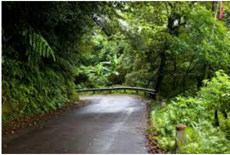
Road traces Ho Chi Minh Trail.

7:00 a.m. breakfast, check out and travel west toward Laos. Stop at Truong Son Cemetery. Lunch on the road, then Khe Sanh U.S. Marine base, site of VC-NVA siege in 1968. Travel scenic route along the Ho Chi Minh Highway through beautiful forested mountains near the Lao border. Check in at Do Thanh Hotel in A Luoi, dinner at the hotel.