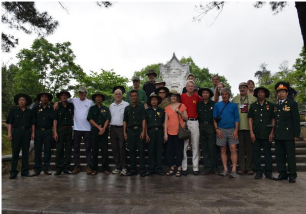
VFP members pose with Vietnamese veterans visiting Truong Son National Cemetery, a place of serenity where veterans and families pay respects to loved ones lost in battle.

7:00 a.m. breakfast, check out and travel west toward Laos. Stop at Truong Son Cemetery. Lunch on the road, then Khe Sanh U.S. Marine base, site of VC-NVA siege in 1968. Travel scenic route along the Ho Chi Minh Highway through beautiful forested mountains near the Lao border. Check in at Do Thanh Hotel in A Luoi, dinner at the hotel.