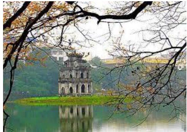
Turtle Tower at Hoan Kiem Lake, made famous by the Legend of the Returned Sword.