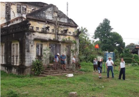
Hung Long Church ruin is a grim reminder of the 1972 battle of the Quang Tri Citadel.

Breakfast at hotel, check out and depart to Noi Bai Airport for flight to Hue. Board coach at Hue airport for 1.5-hour drive to Quang Tri Province. Stop at Long Hung Church, relic of 1972 battle of the Quang Tri Citadel. Tour the former DMZ and historic Vinh Moc Tunnels. Check in at Huu Nghi Hotel in Dong Ha and enjoy Viet Nameese dinner at the hotel restaurant, early to bed for a long day tomorrow.