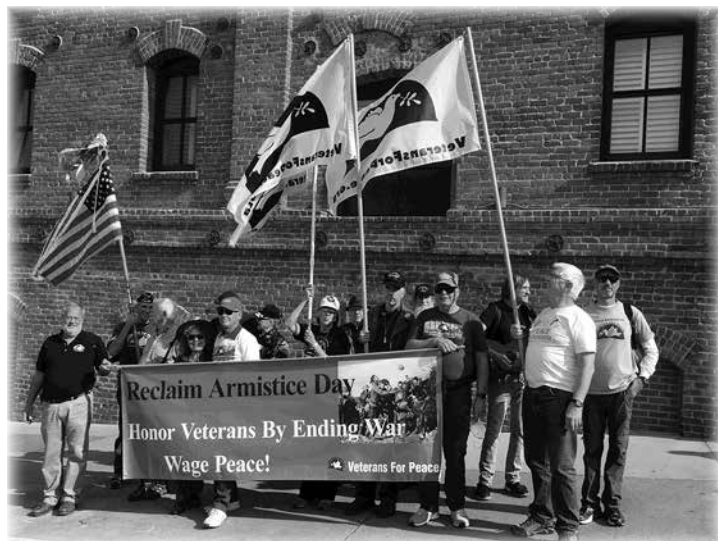
VFP Chapter 69 after the 2018 San Francisco Veterans Day Parade, deciding where in Fisherman's Wharf to have lunch. Waging peace requires really HARD decisions.