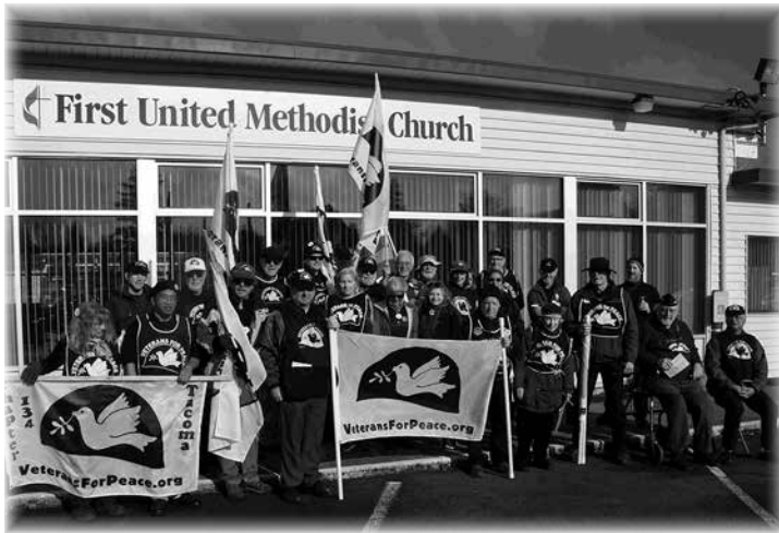
Paused here for a group shot, Seattle Chapter 92 and Tacoma Chapter 134 members marched (and sang!) in the Veterans Day Parade held in Auburn, Washington, on November 10, 2018.