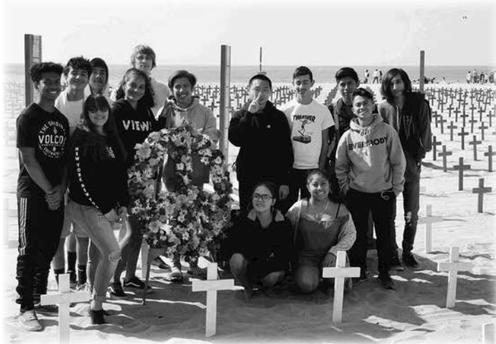
Santa Monica Beach, California—One group of the many high school students who volunteered with VFP-Los Angeles Chapter 7 to help set up the Arlington West Memorial on Armistice Day this year. These students also made the wreath in the picture.

On Armistice Day we stood at Monument Square with VFP flags flowing as the so-called parade passed. Our “Reclaim