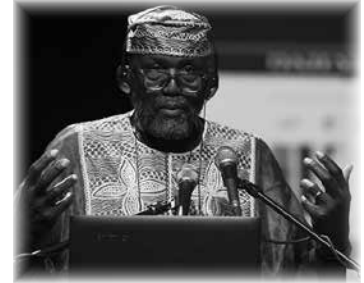
Ajamu Baraka, Black Alliance for Peace, U.S.