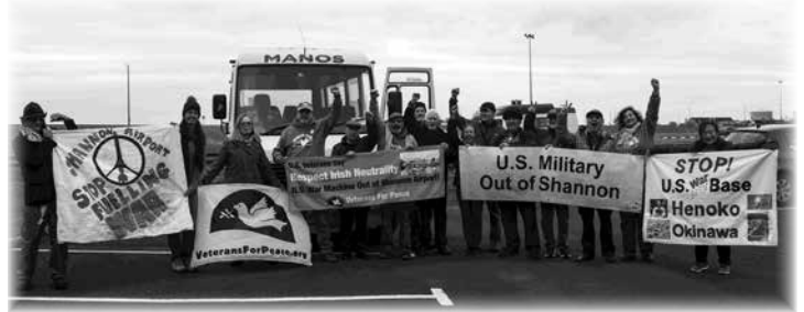
Veterans For Peace members from the USA and Ireland staged a protest at Shannon Airport on November 19, 2018.