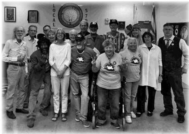
The Tucson Chapter sends greetings!

Since the 2017 VFP International Convention in Chicago, Chapter 13 has taken "Peace at Home, Peace Abroad" to heart. From "Say NO to VA Privatization" to the SOAW Border Encuentro in Nogales, Sonora/Arizona, to the ongoing support for refugees along the border, we continue to expose the true costs of war and war's futility. We participate in vigils against war at Speedway's recruitment center, against manufactured