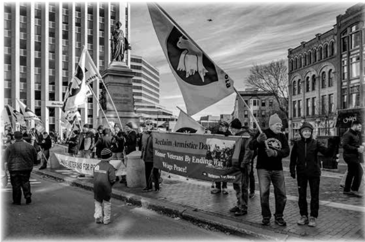
Chapter 1 members with lots of VFP flags and a “Reclaim Armistice Day” banner gather at Monument Square, along Portland’s parade route, to protest the glorification of war.