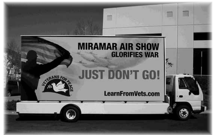
Chapter 91 published a mobile billboard to publicize its Miramar Air Show boycott campaign, which serves to educate the public about the harmful effects of glorifying war.

The summer and fall of 2018 found San Diego Chapter 91 very active in many ways. We marked our third year educating the public here not to attend the annual Miramar Air Show in September by banner over the I-15 each Thursday during July, August, and September, getting press coverage and purchasing a mobile billboard, after being unable to buy a commercial billboard in this military-friendly town.