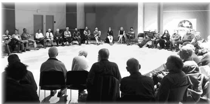
People discuss strategies to confront imperialism at the Linus Pauling Chapter's Armistice Day public forum in Corvallis, Oregon.

VFP Linus Pauling Chapter joined with the local chapter of Democratic Socialists of America (DSA) to host a public forum for Armistice Day, "Confronting Imperialism." The November 11 event drew 55 people with a wide range of political views and group affiliations.