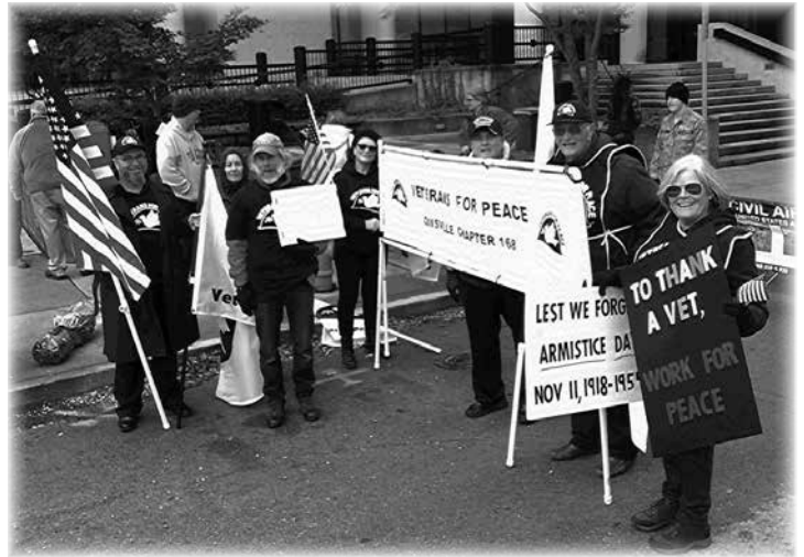
Chapter 168 members take a stand for Armistice Day at the 2018 Veterans Day Parade in Louisville, Kentucky.