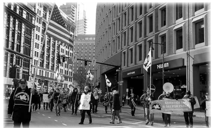
Members of the Smedley D. Butler Brigade Reclaim Armistice Day in the Boston parade.