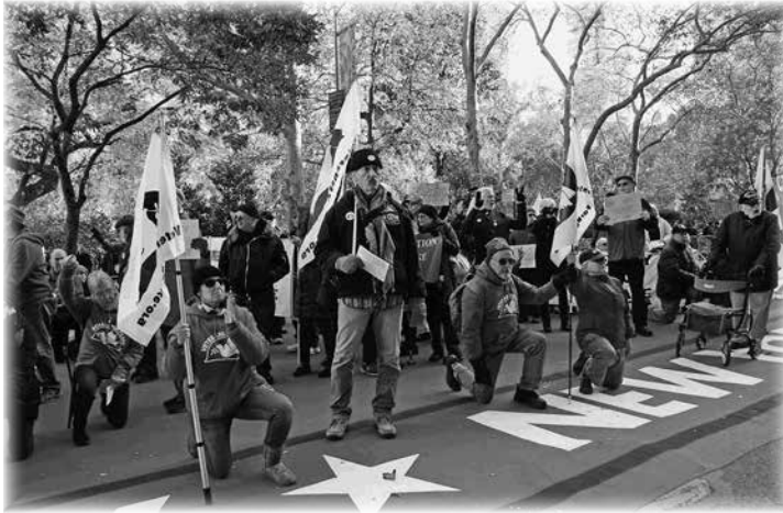
Members of New York City Chapter 34 take a knee at the NYC Armistice Day Parade reviewing stand.

Chapter 34, honored for its activism with the Chapter of the Year award at the 2018 VFP National Convention, continues to be very active, keeping up VFP presence at rallies, demonstrations, and educational events regarding continuing U.S. military involvement in Yemen, Iran, North Korea, and Afghanistan, and coordinating with other peace groups, including CODEPINK,