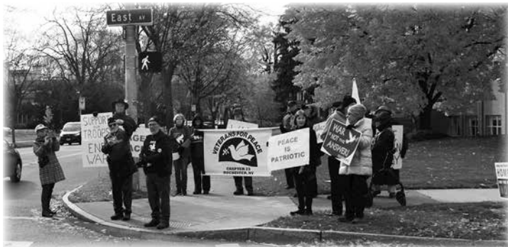
Chapter 23 members and friends at the Armistice Day rally in Rochester, New York, Sunday, November 11. After an 11 am bell-ringing ceremony, the group distributed VFP's "Reclaim Armistice Day" flyers to passersby.