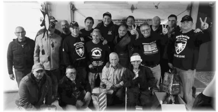
Sent as a Christmas greeting from Unified U.S. Deported Veterans Resource Center/VFP Sgt. Barrios Memorial Chapter #182: "May 2019 bring the joy of Peace and Justice we all seek."

U.S. Deported Veterans vow to continue to serve, in the true