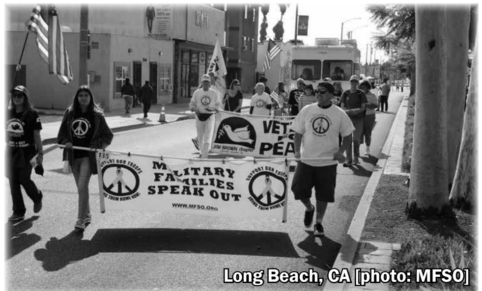
Long Beach, CA

The centennial anniversary of the World War I Armistice falling on a Sunday presented some challenges, but it also created opportunities for chapters, and we engaged more faith communities than ever before. Veterans For Peace chapters and members across the country encouraged local churches and other houses of worship to ring bells 11 times at the 11th hour of the 11th day of the 11th month—just as they did in 1918, when the Armistice was signed.