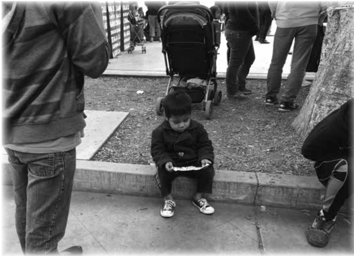
A boy waits patiently for his family's number to be called—a wait that could go on for months.

more problems than we solved, which is something you need to consider when you don't have enough for everyone.