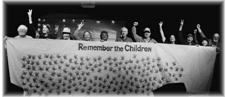
VFP members from the USA, Ireland, and the U.K. show off an art banner commemorating children killed in wars, at the International Conference Against U.S./NATO Military Bases held in Dublin, Ireland, on November 18, 2018.